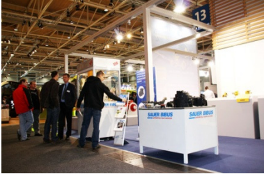
Picture 1 - SAUER BIBUS at the Agritechnica 2009. Many visitors to the stand found out about the ICVD drive technology for agricultural machinery.