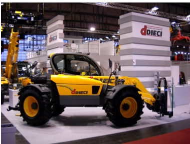
Picture 2 - The Italian telescopic ladder manufacturer DIECI also relies on the ICVD technology of SAUER BIBUS and presented vehicles with this drive technology under its "VS" label, which stands for "Vario System".